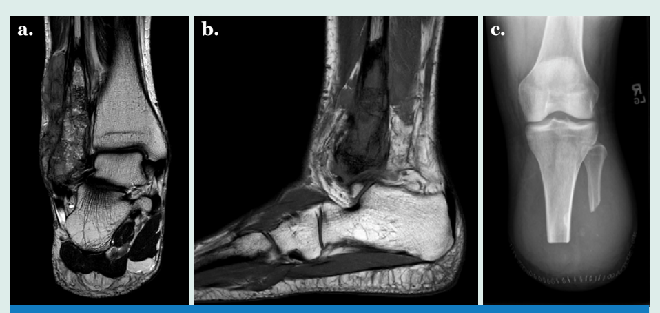
Figure 2: 37 year old Male, Ewing's sarcoma of the distal fibula. Coronal (a) and sagittal (b) MRI scans highlight the extensive involvement, and AP radiograph (c) of the below knee amputation required to achieve a wide margin for the tumour resection.

Primary bone and soft tissue tumours are rare and require specialist care. In the UK they are primarily managed in five specialist sarcoma units, with adjunctive treatments