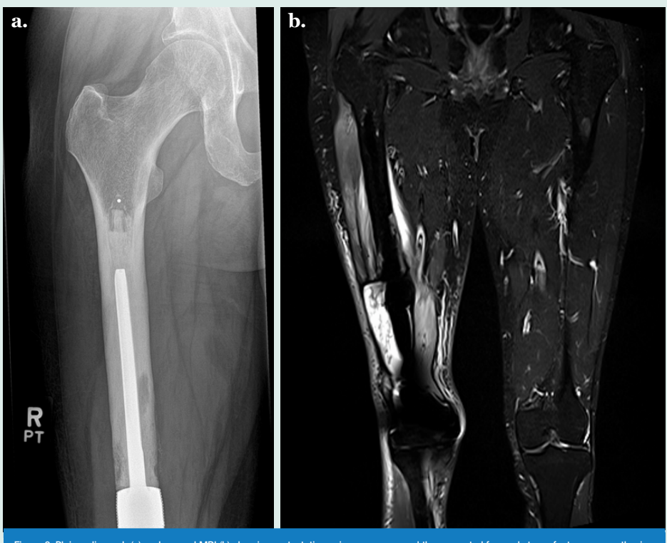
Figure 3: Plain radiograph (a) and coronal MRI (b) showing metastatic angiosarcoma around the cemented femoral stem of a tumour prosthesis. A hip disarticulation was required.

References can be found online at www.boa.ac.uk/publications/JTO.