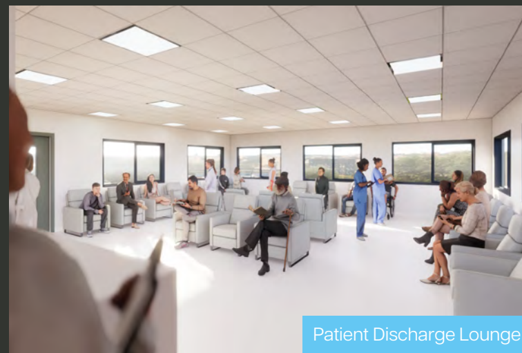
Patient Discharge Lounge