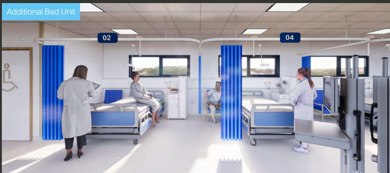
Additional Bed Unit