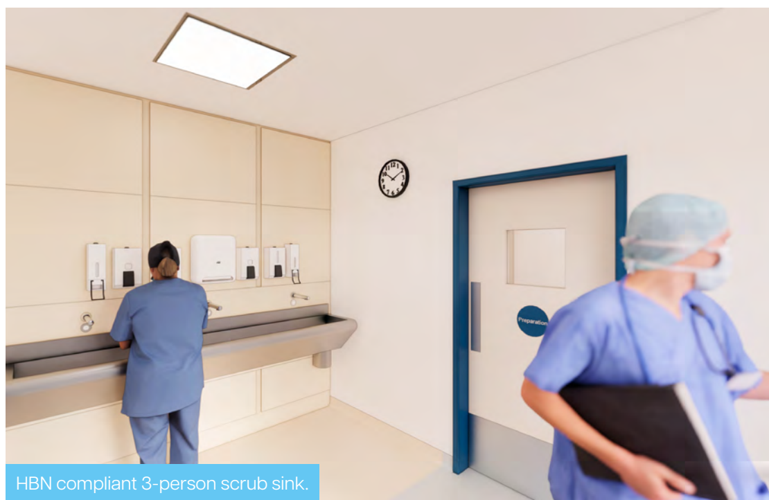
HBN compliant 3-person scrub sink.

Ultraclean Ventilation System, providing controlled laminar airflow with HEPA filtration. Delivered in partnership with Medical Air Technology.