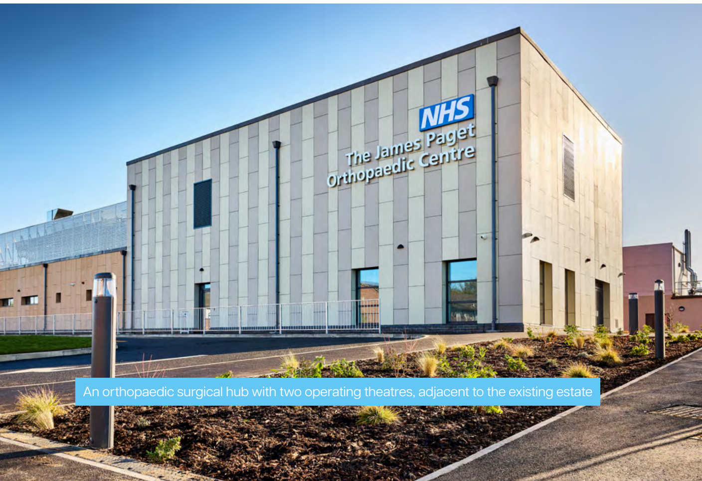
An orthopaedic surgical hub with two operating theatres, adjacent to the existing estate