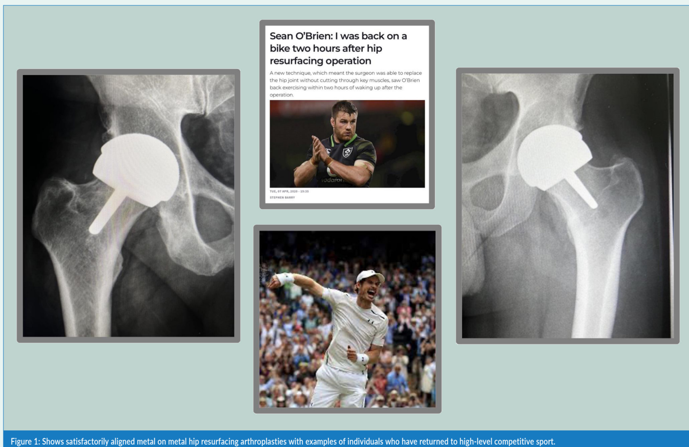
Figure 1: Shows satisfactorily aligned metal on metal hip resurfacing arthroplasties with examples of individuals who have returned to high-level competitive sport.

Adept, MatOrtho), survivorship in appropriate patients in both the NJR and AOANJRR, compares favourably with similar younger patients undergoing more traditional THR. In the UK, NJR survival rates of around 10% at 15 years and 12% at 20 years are reported. Many have suggested that HRA patients are atypical. Many have increased, and some extreme, activity requirements. There are examples of professional sportsmen, in tennis, rugby and cycling, returning to high-level performance post HRA surgery.