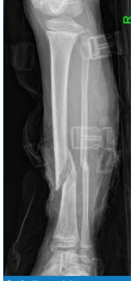
Figure 3: ...with some comminution.

At stage one, the comminuted bone fragment was loose and devitalised, so was removed leaving two-thirds remaining cortical contact. (Figure 4). A monolateral external fixator was applied in this case, along with a vacuum dressing (Figure 5). The choice of temporary stabilisation is down to the surgical preference of the orthopaedic and plastic surgical team, while bearing in mind the characteristics of the fracture and planned future definitive fixation.