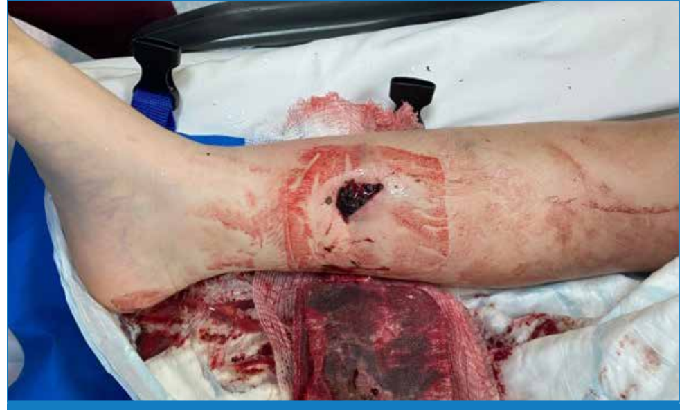
Figure 1: Open tibia fracture prior to application of a saline-soaked gauze dressing.

His foot was well-perfused with normal sensation. Plain X-rays confirmed a diaphyseal tibial fracture with some comminution (Figures 2 and 3). No other injuries were identified on clinical assessment and this was confirmed with a trauma CT series, including a CT angiogram. This is routine practice in our unit to assess the vascular anatomy of the limbs and to plan reconstructive options.