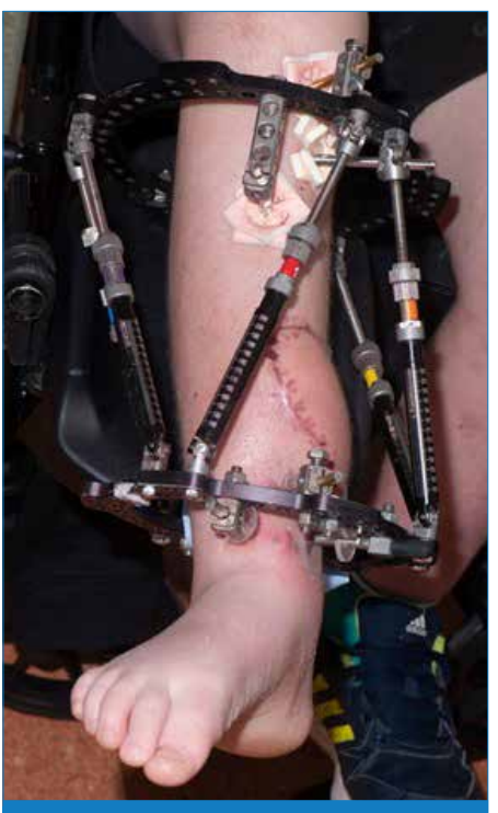
Figure 6b: Free flap soft tissue coverage.

surgery (namely removal of metalwork). Although the anterolateral thigh flap (ALT) is our most commonly used flap in adult open tibial fractures, we use the scapular flap most commonly in children, as it has extremely consistent and reliable vascular anatomy compared to the perforator-based ALT flap. However, the patient must be placed in a lateral (or prone) position to raise a scapular flap.