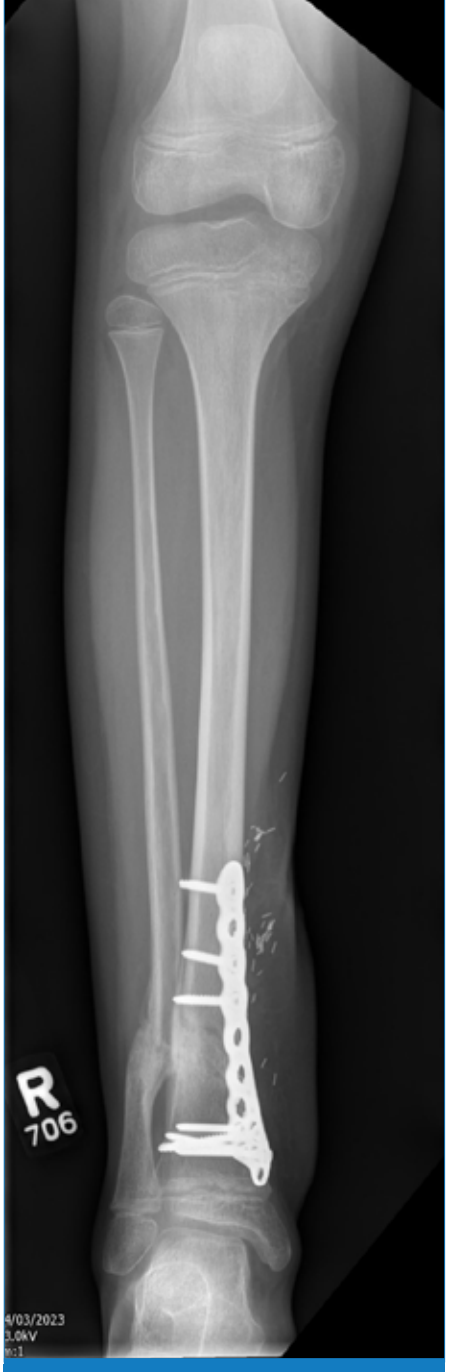
Figure 8: Versatilty of modern locking plates.

Although these techniques avoid the need for microsurgical reconstruction, they require extended periods in ring fixators, multiple procedures and associated morbidity. We have not needed to use these methods, but could perhaps consider them in the unlikely event that flap coverage was not possible or unsuccessful.