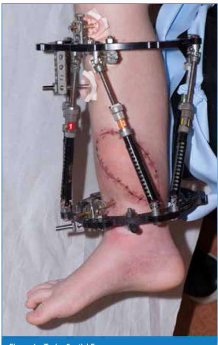
Figure 6a: Taylor Spatial Frame.

The choice of flap reconstruction is dependent on surgeon preference, but also patient factors. In our centre, we have found that free fasciocutaneous flaps afford better functional outcomes than local flaps<sup>4</sup>. Local flap options may also be compromised by the zone of trauma. We prefer to use fasciocutaneous flaps rather than muscle flaps, as we find post-operative monitoring more reliable, and the skin flap is easier to re-raise for secondary