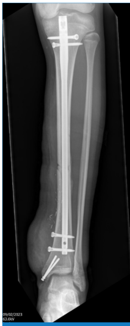
Figure 9: Adult medullary nails.

Hexapod fixators are commonly used as definitive treatment for paediatric open lower limb trauma in our department, and our practice is to use a combination of hydroxyapatite-coated half-pins and trans-osseous wires to obtain at least two points of fixation above and below the fracture zone. The advantage of this form of fixation is stability, and the ability to easily monitor the soft tissues. In cases where bone loss has occurred or there is imperfect reduction, the frame can be programmed to potentially correct for this once