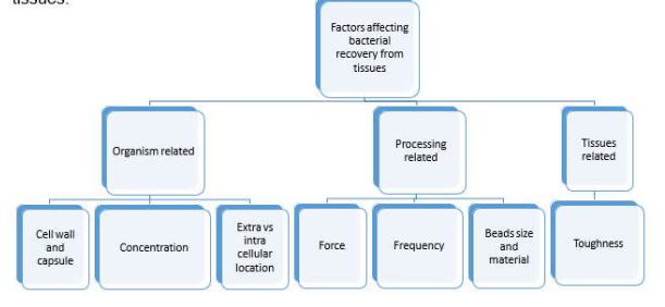
Figure 4 : Different factors affecting bacterial recovery from potentially infected tissues.

Figure 3 : E.coli treated with Proteinase K for 10 minutes. From left to right: control, E.coli suspended in albumin, E.coli suspended in PBS