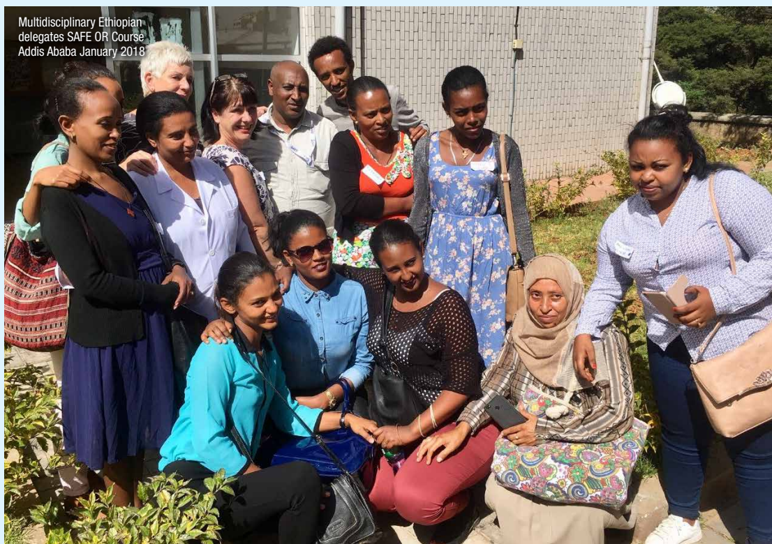
Multidisciplinary Ethiopian delegates SAFE OR Course Addis Ababa January 2018

The next immediate challenge that WOC is being asked to support in Ethiopia is standardisation and consistency in its orthopaedic residency training programmes and final exams which are currently delivered in